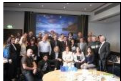
Participants from the conference

as a national priority. Moreover, it proposes to address the issues faced by disadvantaged youth from rural areas with targeted labour market measures aimed at minimising the risks of engaging in irregular migration. Its implementation approach is based on a set of coordinated interventions that draw on the mandate, expertise and added value of the national and local partners as well as of the ILO, IOM, UNDP and UNICEF.