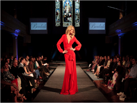
Showcase from Beulah London, one of the fashion brands at the forefront of ethical production

“The road to recovery for victims of trafficking can be a long journey...to really help them secure their future, we need to provide them with tools to empower themselves”