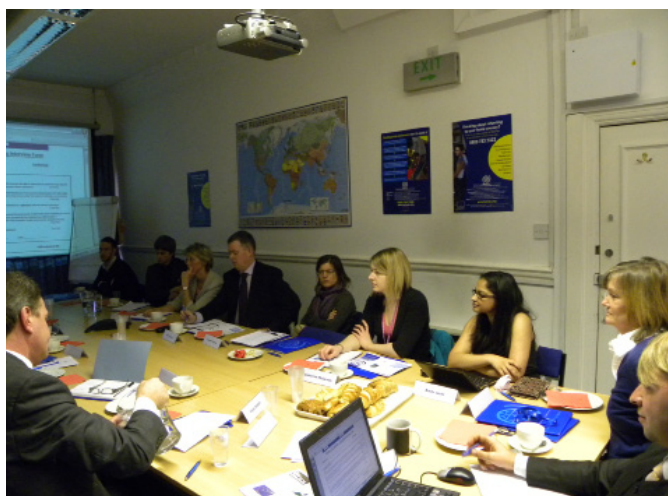
Round Table about Counter-Trafficking held on 25 February at IOM London

In this respect, discussions were held on provision of direct assistance to Victims of Trafficking in the UK as well as the collection and sharing of information on victim care and support among agencies in the UK for the purposes of piloting joint initiatives in prevention/protection/prosecution.