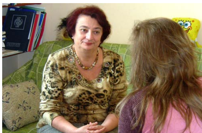
After the traumatic experience of trafficking, most victims suffer from various traumas. IOM assists them with professional psychological help.

IOM and UNHCR have produced a Framework Document for Developing Standard Operating Procedures to Facilitate the Protection of Trafficked Persons . This document seeks to enhance the protection of and assistance to trafficked persons by encouraging closer interagency cooperation through the development of standard operating procedures at the country level.